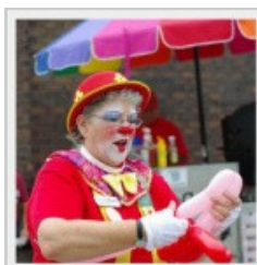
Daffy Dill The Clown

Daffy Dill will be sharing some amazing Christmas balloon ideas. Not only will she demonstrate these holiday creations, but you will have the opportunity to follow along, twist by twist with Daffy Dill leading the way. The Alley will provide any of unusual balloons needed, like hearts, 160’s etc. Remember to bring your regular balloons and pump!